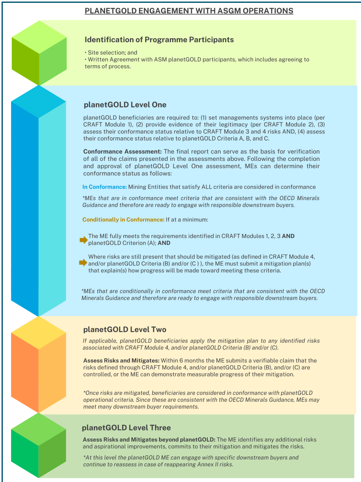
Figure 1: planetGOLD Implementation Process Overview