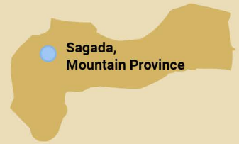
Sagada, Mountain Province

Paracale's rich history in gold mining can be traced back to the Spanish era (1626); notably, the municipality derived its name from "para cale." meaning "canal digger."