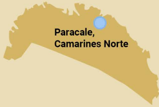
Paracale, Camarines Norte