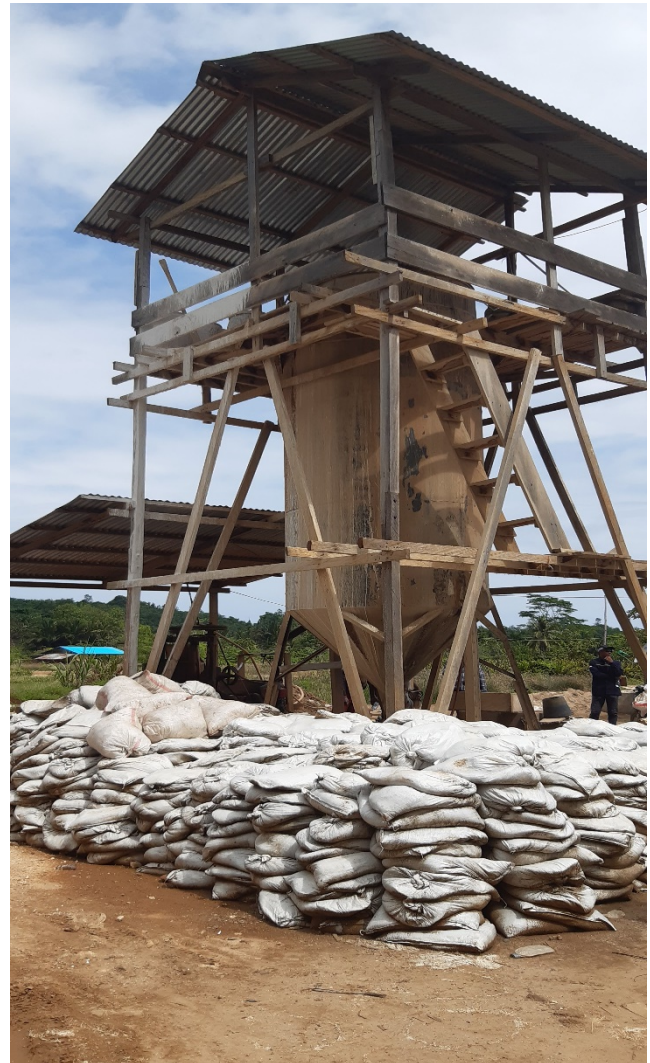
Fig.1 Five tonnes capacity Leaching Tank in Obi Island, Halmahera, Indonesia

GOLD ISMIA will investigate ore availability and grade at the 6 project areas to assess the applicability of these two mercury-free technology scenarios for miners.